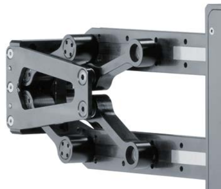
The kinematic connection of the two horizontal axes guarantees a vertical stroke of 70mm

The advantages are clear. The same machining processes are handled in a smaller area. The floor space savings are immense here, as twice the number of work stations can be set up on the exact same rotary indexing table or linear assembly system. At the same time, output enjoys a dramatic boost, as the transport times from one processing station to the next are reduced. In some cases, the optimisation potential can reach almost as much as 50%.