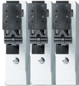
Three in series: the front view of the new HP70